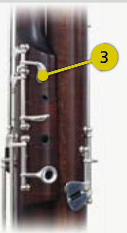
left hand front 3 additional high E key