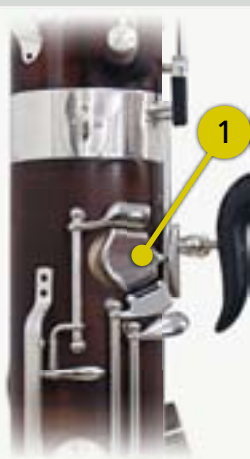
right hand back 1 ergonomically shaped low E touch

Our standard model with the qualities of a professional bassoon plays evenly and with secure intonation over the whole range. It is made from mountain maple grown in selected areas which has been seasoned over a period of several years. The wooden body is fabricated using CNC equipment designed for maximum precision and consistency in the production process. The bore is fashioned in exactly the same way as for our professional models. The new mechanism is designed to be comfortable, and features 7 rollers, and is finished with high-quality silver plating. All the finger holes have ebonite liners that extend into the bore. The surface of the body is finished with a durable matt-finish synthetic lacquer.